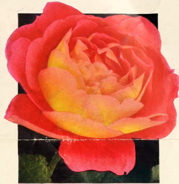
★Condesa de Sastago. $1.25 (in ★ Dozen)

Nigrette is sold out for fall delivery. Cash orders are being booked for dormant, field-grown plants for delivery next spring. Guaranteed to bloom in June and until frost.